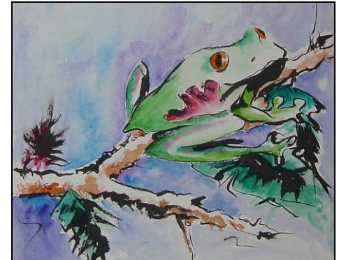
Cain Frog 02, 2005